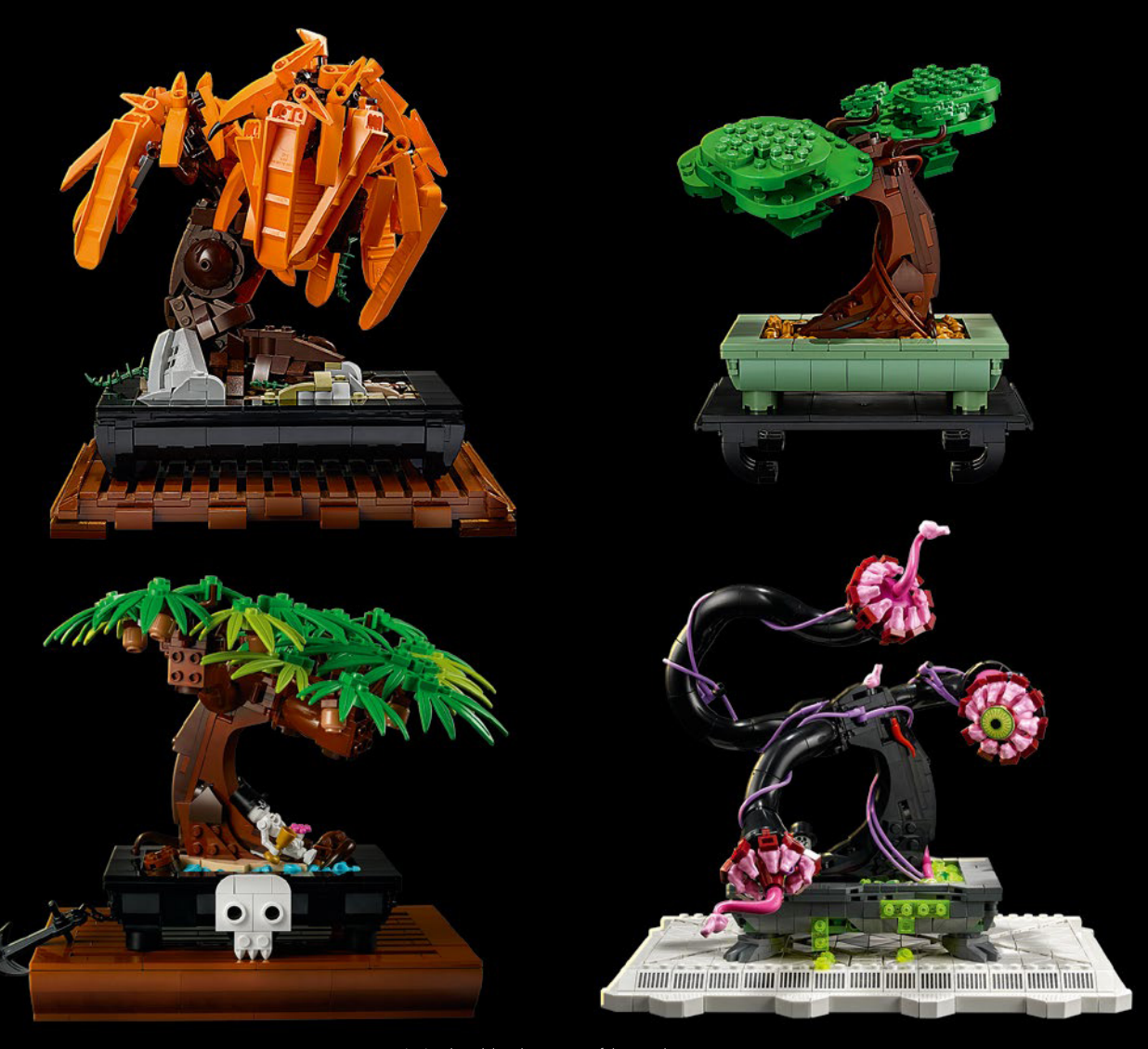
Inspirational models only. Not part of the actual set