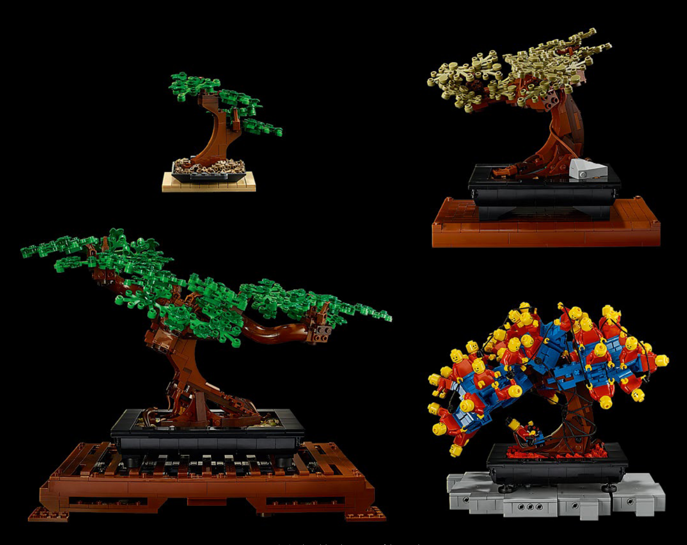
Inspirational models only. Not part of the actual set