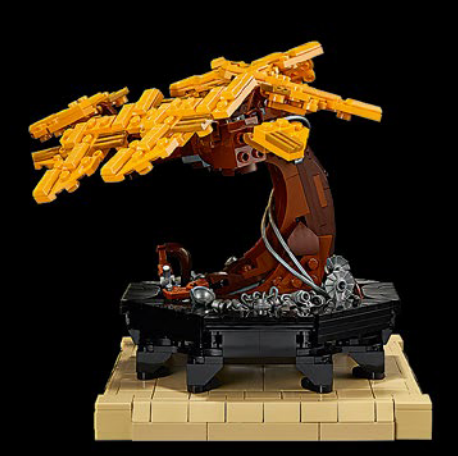
Inspirational models only. Not part of the actual set